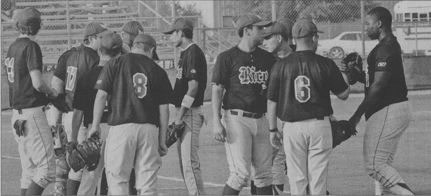
The Raider Baseball Team gets ready for their playoff game last Thursday in Bastrop.